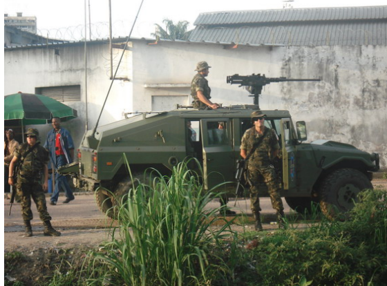
Spanish EUFOR troops in Kinshasa

The run up to the election and its immediate aftermath has been plagued by unrest across the country, belying the relative calm of the Election Day itself: protests by demobilised militiamen, particularly in Equateur, have created significant security