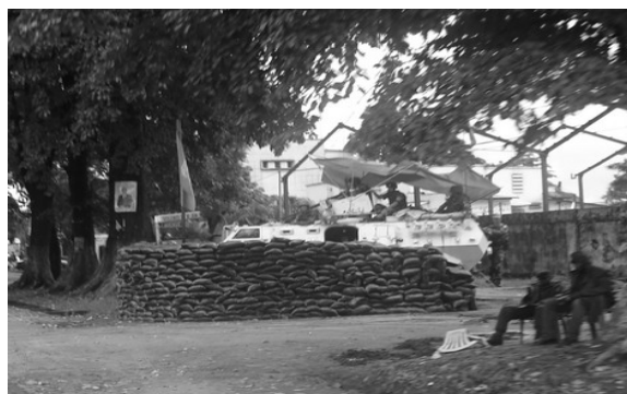
MONUC forces outside Bemba’s Residence, Kinshasa FEWER-Africa